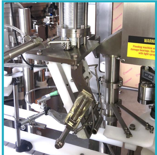
New Tamper Rail Holds End on Can