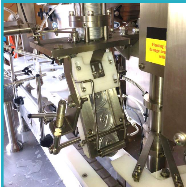
Cap On Foam Before Starwheel